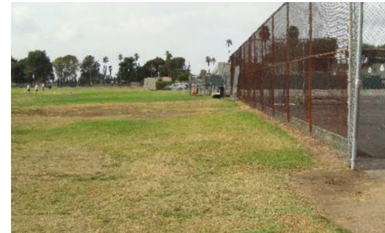
Playing fields in fair to poor condition.