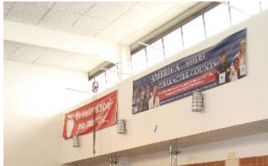
Replace leaking clerestory windows in locker rooms.