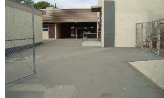
Poor asphalt conditions throughout campus.