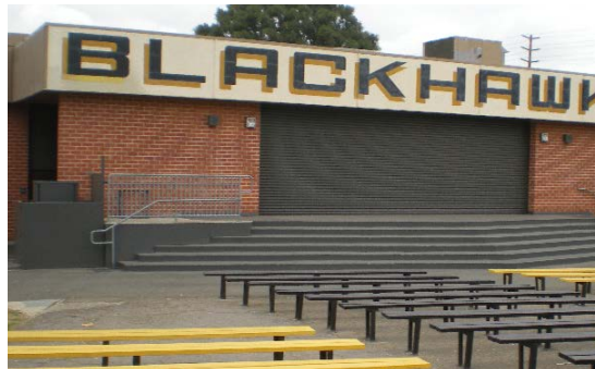
Repurpose amphitheater area.