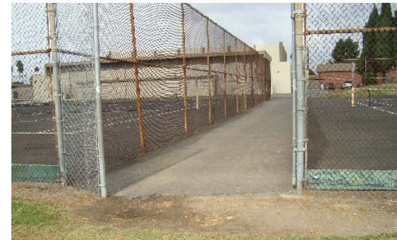
New fencing required in various areas.