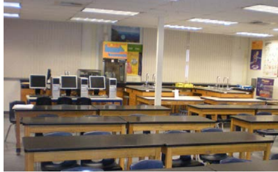
Need computer labs to meet Common Core requirements.