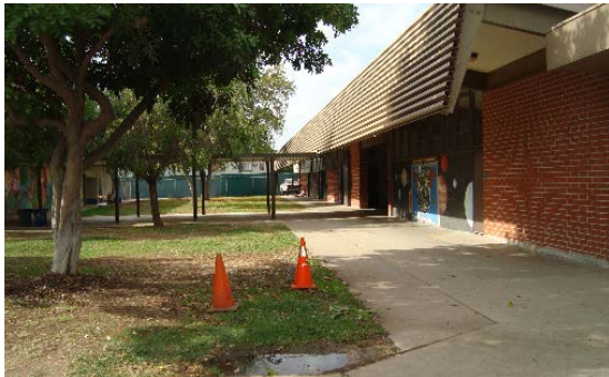
Major drainage/ponding issues in campus courtyards.