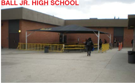
Need to add lunch shelters.