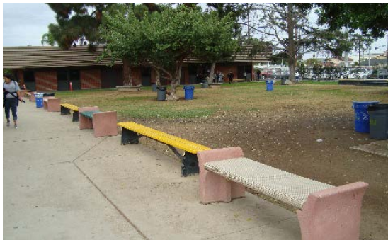
Campus quad in poor condition.